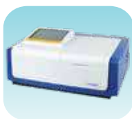
UV/VIS Spectro 2080+ Double Beam

Analytical Technologies is synonymous for offering technologies for doing analysis and is the Fastest Growing Global Brand having presence in at least 96 countries across the global. Analytical Technologies Limited is an ISO:9001 Certified Company engaged in Designing, Manufacturing, Marketing & providing Services for the Analytical, Chromatography, Spectroscopy, Bio Technology, Bio Medical, Clinical Diagnostics, Material Science & General Laboratory Instrumentation. Analytical Technologies, India has across the Country operations with at least 4 Regional Offices, 6 Branch Offices & Service Centers. Distributors & Channel partners worldwide.